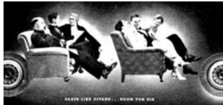
SEATS LIKE DIVANS - ROOM FOR SIX