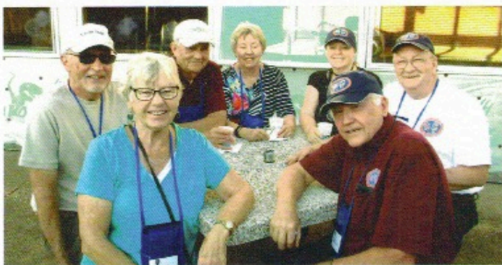
Some Sociable Airflowers at the Ice Cream Social!