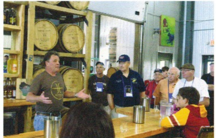
Brewery Tour—note everyone's rapt attention.