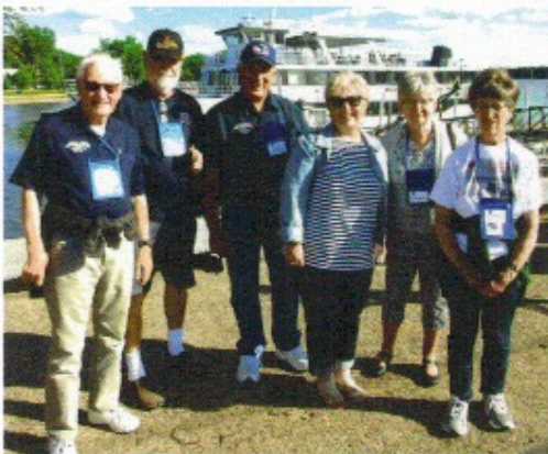
A beautiful evening for a river cruise.