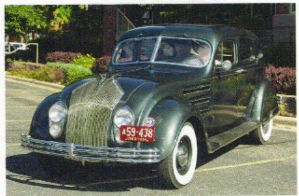
The Corder Clan, 1934 Chrysler CU