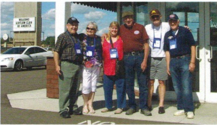
Airflow Welcoming Committee at the Hudson House.