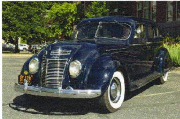
Phil Putnam, 1937 Chrysler C-17