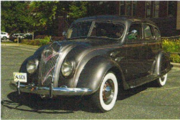
Neal Jacquot, 1936 DeSoto S-2