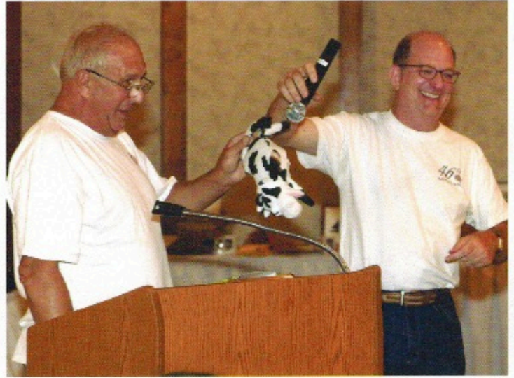
Legendary Laughing Cow