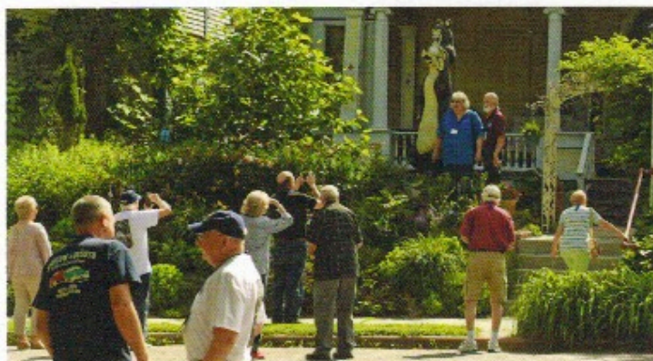
At Hamm's Mansion