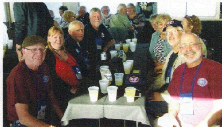
A few members on the riverboat cruise. Boy, those margaritas were good!