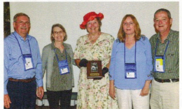
2nd Place The Corders