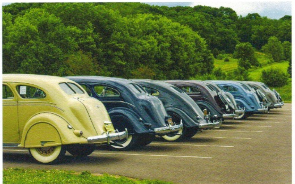
Airflows at the winery

An awards banquet was the final event of the day. We had a great turnout with over 100 attendees and 24 Airflows. Participants came from as far away as California, Maryland, Canada, and Australia.