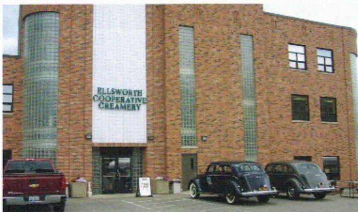
Art Deco Cars at a 'somewhat' Art Deco Creamery