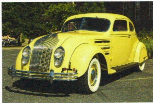
Chuck and Char Cochran, 1934 Chrysler CU