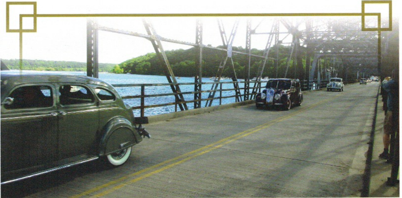
Crossing the Beautiful St. Croix in Beautiful Airflows

The other option on Friday was a caravan, mostly of Airflows, on a driving tour of St Croix and Pierce Counties of Wisconsin. This included stops at the 45th Parallel Distillery in New Richmond, WI, then on to a lunch stop at Belle Vinez winery in River Falls, WI, then Ellsworth Cooperative Creamery cheese factory in Ellsworth, WI for cheese and ice cream. Ellsworth is the "Cheese Curd Capital of Wisconsin. In spite of a couple of missed turns we completed the circuit and a good time was had by all.